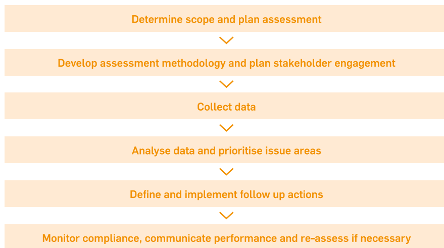
FIGURE 1: Assessing human rights risks and impacts – schematic process

A number of companies begin addressing the topic by first analysing the risks of adverse human rights impacts at a global level. This allows them to gain an overview of issue areas for their entire company. Building on this they identify areas where more in-depth human rights due diligence measures are required (such as stand-alone HRIAs and activities for integrating a human rights lens into existing processes). Other companies start by assessing potential and actual impacts in a specific context, such as one of their locations, a certain product or a specific supply chain. These analyses serve as a basis for developing additional measures tailored to the specific business context or are aimed at improving the centrally managed processes. Other businesses prefer to incorporate aspects of human rights into existing risk and compliance management processes and integrate them into existing assessments.