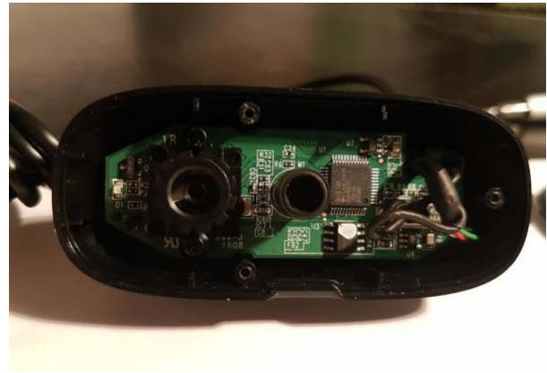
Figure 2: Interior view of the wireless wearable research tool, consisting of a HD video camera for macro 1 x 1 inch coverage of participant's skin surface for goose bump recording.

technology now readily available with the surge of wearable biosensing technology like FitBit for health monitoring, and biosensing interfaces for entertainment (gaming) to replace traditional game controllers.