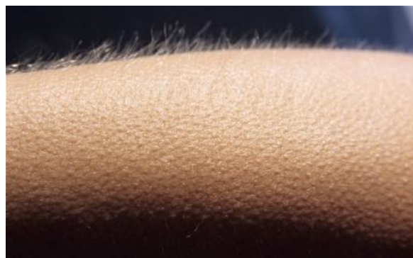
Figure 1: Appearance of goose bumps on skin.

Awe-inspiring events in our natural world are quite rare but when they occur, it is with an immediate and intense manner that can be felt as a sensation of ‘chills’ or with the elicitation of goose bumps on the skin [8], see Fig. 1. This can be measured via physiological biosignals via skin surface video recording, which delivers an objective, unobtrusive means of recording and analyzing triggers of these states. In the study of profound transformative experiences, it is important to be able to objectively monitor the phenomenon for validity, but also to remove the burden of self-report from the participant. Reliance on self-reports of feelings can have major drawbacks, including the need for users to continuously self-monitor which can have the unwanted effect of removing them from an emotional state, and this data typically is retrospective. To address this, Benedek & Kaernbach [9] suggest physiological monitoring of these peak emotional events with many real-time physiological devices now that can collect data. While researchers now understand many of the psychophysiological mechanics that correlate with powerful affective states like awe and fear, there is currently few ways to measure the magnitude of this correlation, and therefore classify the target states accurately.