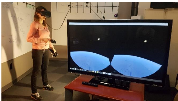
Figure 3: experimental setup with participant ‘earthgazing’.

For this study, we are interested in feelings of peak positive affect while interacting with immersive VR. Our stimulus is a visualization of the Earth, in which many participants experience a sense of awe and wonder through visiting places on earth [12]. We call this stimulus the ‘Earthgazing’ content, and is presented in VR, as seen in Fig. 3. To understand how affect-inducing the Earthgazing content is, we need to compare it to content that was created for dissimilar purposes. We choose an educational game of the same length, designed to be informative in nature and not designed to induce positive affect. Both sets of content are created by the researchers in Unity3D, and use the same navigational interface (HTC Vive hand controllers), and head-mounted display (HTC Vive).