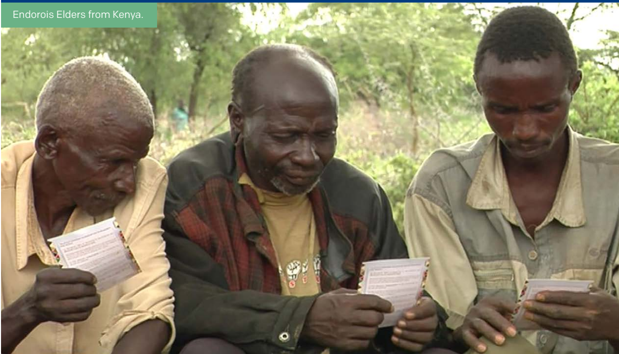
Endorois Elders from Kenya.

The ACHPR has availed its good offices to assist the parties in the implementation of these recommendations. However, the ruling has not yet been fully implemented.