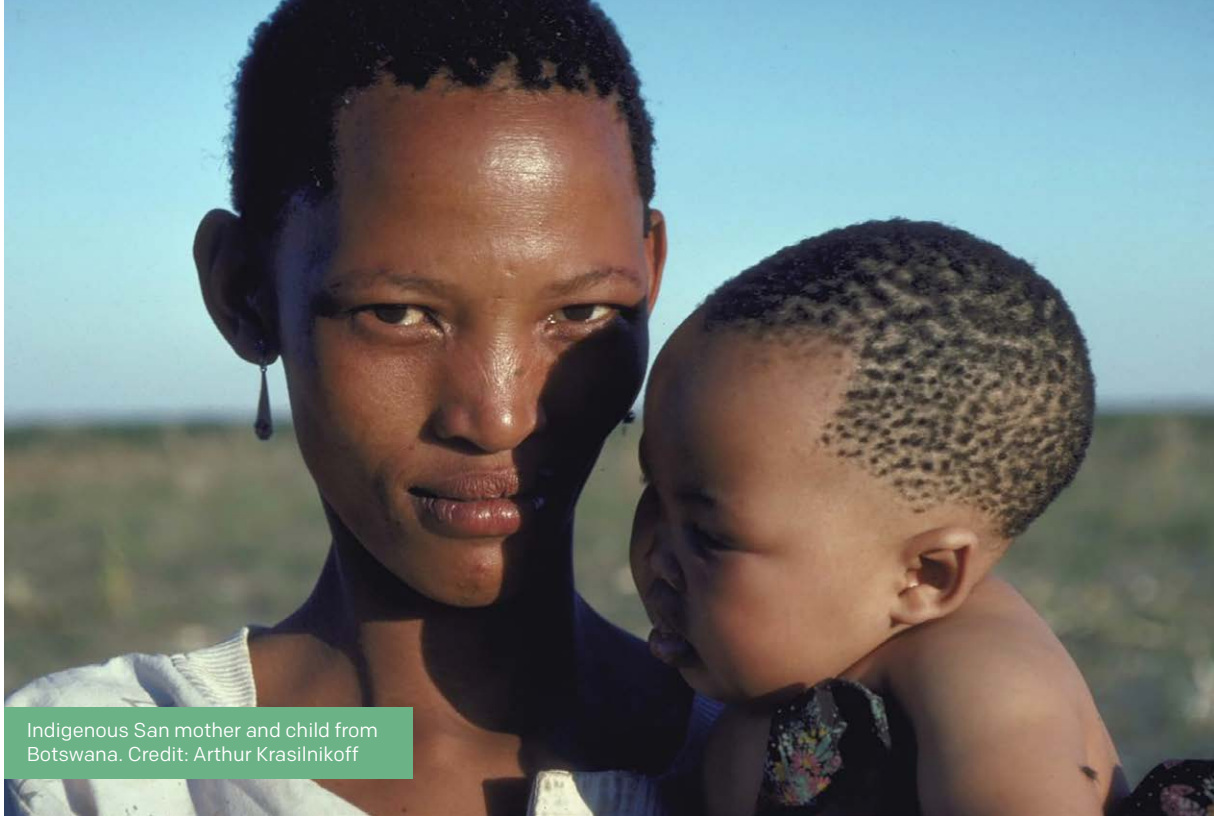
Indigenous San mother and child from Botswana.