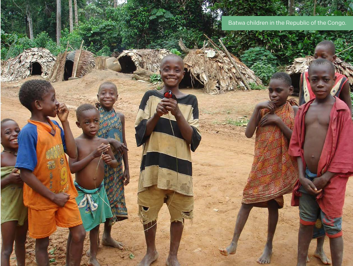
Batwa children in the Republic of the Congo.

In some cases, the WGIP has conducted follow-up visits where the report from the initial country visit is presented and its recommendations discussed thoroughly with all key stakeholders during a national dialogue meeting. This was the case in Gabon, DRC, the Republic of the Congo, Tanzania, Burundi, Kenya and Uganda.