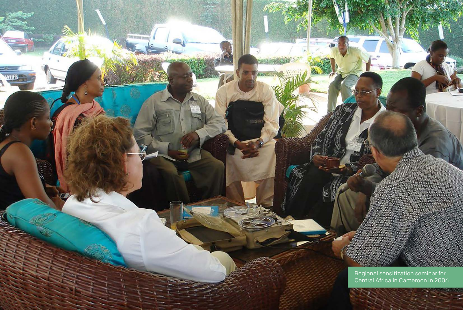
Regional sensitization seminar for Central Africa in Cameroon in 2006.