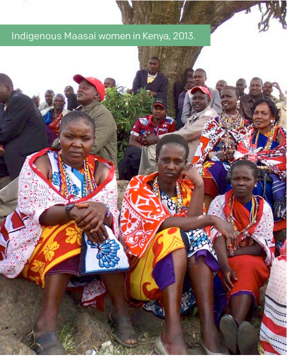
Indigenous Maasai women in Kenya, 2013.

The WGIP has influenced the adoption of 11 resolutions pertaining to Indigenous rights, as listed in Box 3. Many of these resolutions were prompted by reports from Indigenous organisations alleging and evidencing violations of their human rights. While the impact of these resolutions at national level varies, they are clear and strong instruments for the WGIP and ACHPR to promote the rights of Indigenous Peoples under the African Charter.