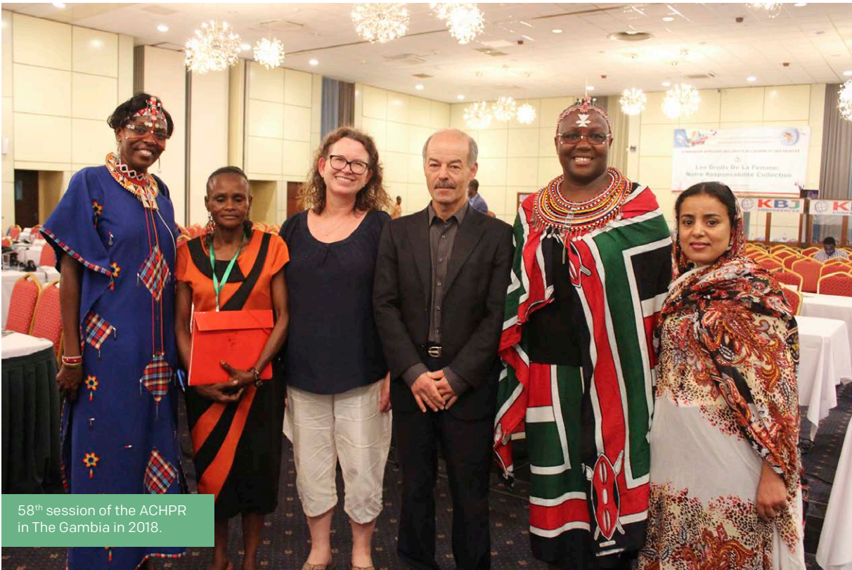
58 th session of the ACHPR in The Gambia in 2018.

Notwithstanding the immensely positive impact of the work of the WGIP over the last 20 years, there is a clear need for further action to promote and implement Indigenous rights on the continent. The WGIP, the ACHPR and, more generally, the whole African human rights system are highly relevant and hold further potential in this regard. The WGIP is an essential platform from which to influence change at national level. In the coming years, the WGIP will hopefully be able to continue and deepen the important, informative and transformative sensitisation achievements and address urgent and persistent issues faced by Indigenous populations and communities in Africa.