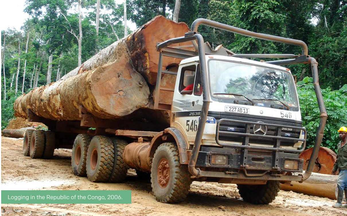
Logging in the Republic of the Congo, 2006.