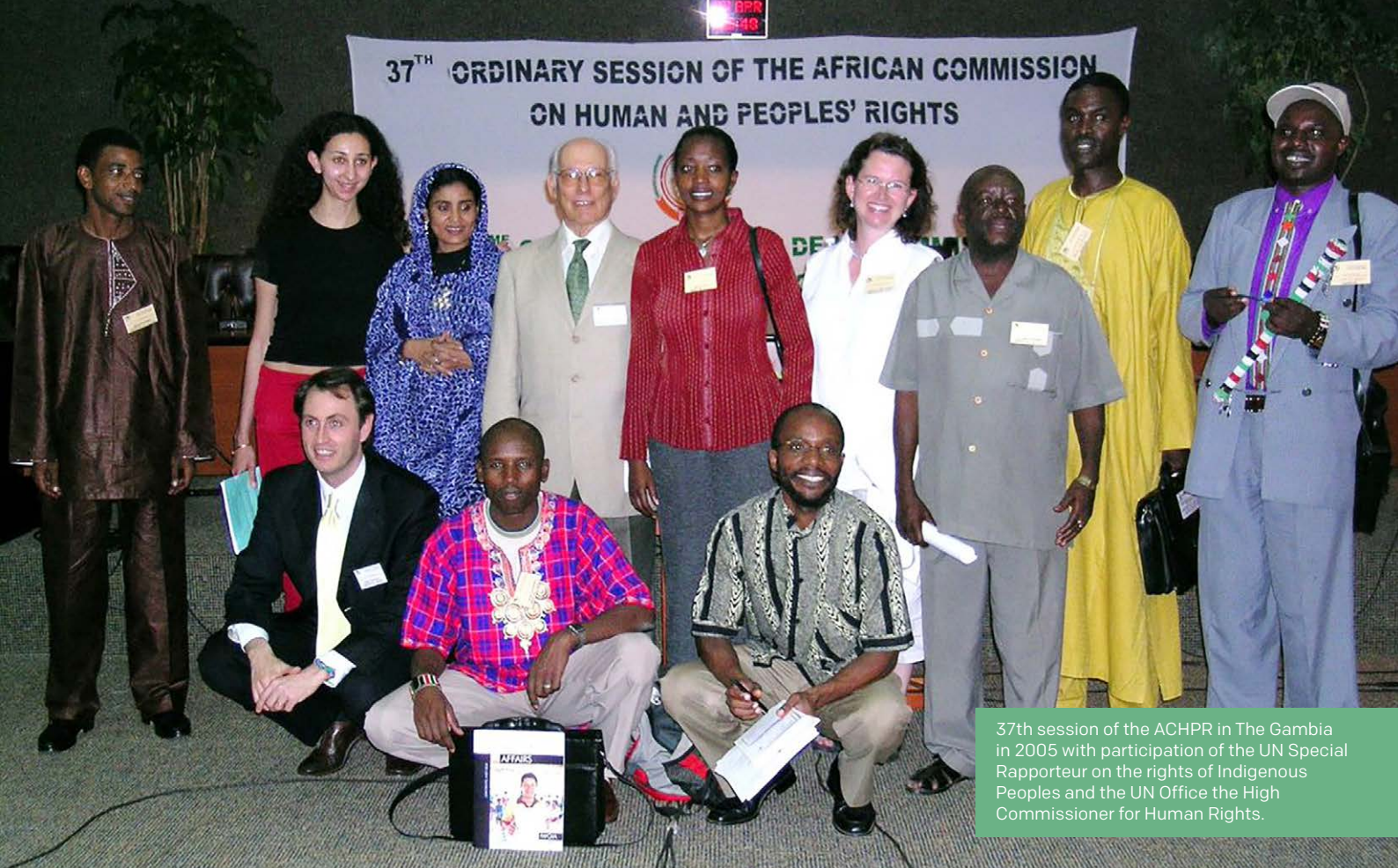
37th session of the ACHPR in The Gambia in 2005 with participation of the UN Special Rapporteur on the rights of Indigenous Peoples and the UN Office the High Commissioner for Human Rights.