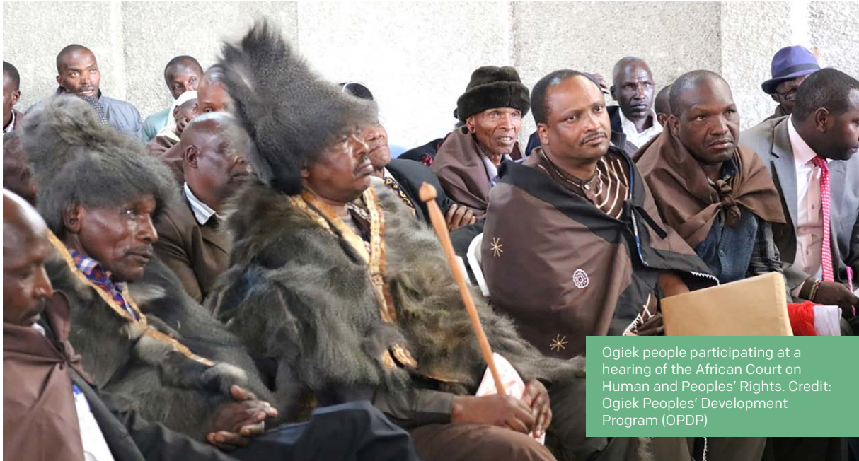
Ogiek people participating at a hearing of the African Court on Human and Peoples' Rights.