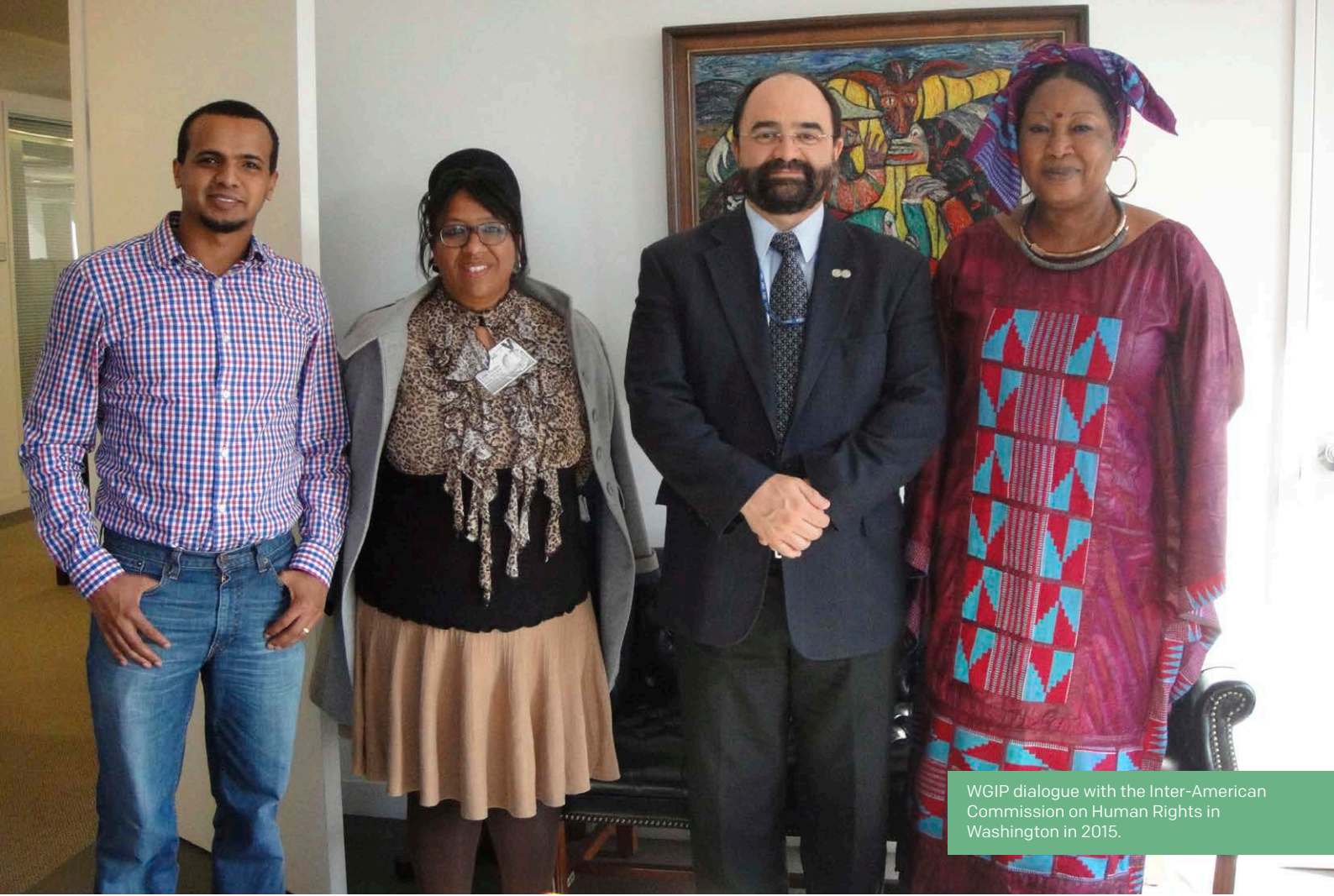
WGIP dialogue with the Inter-American Commission on Human Rights in Washington in 2015.