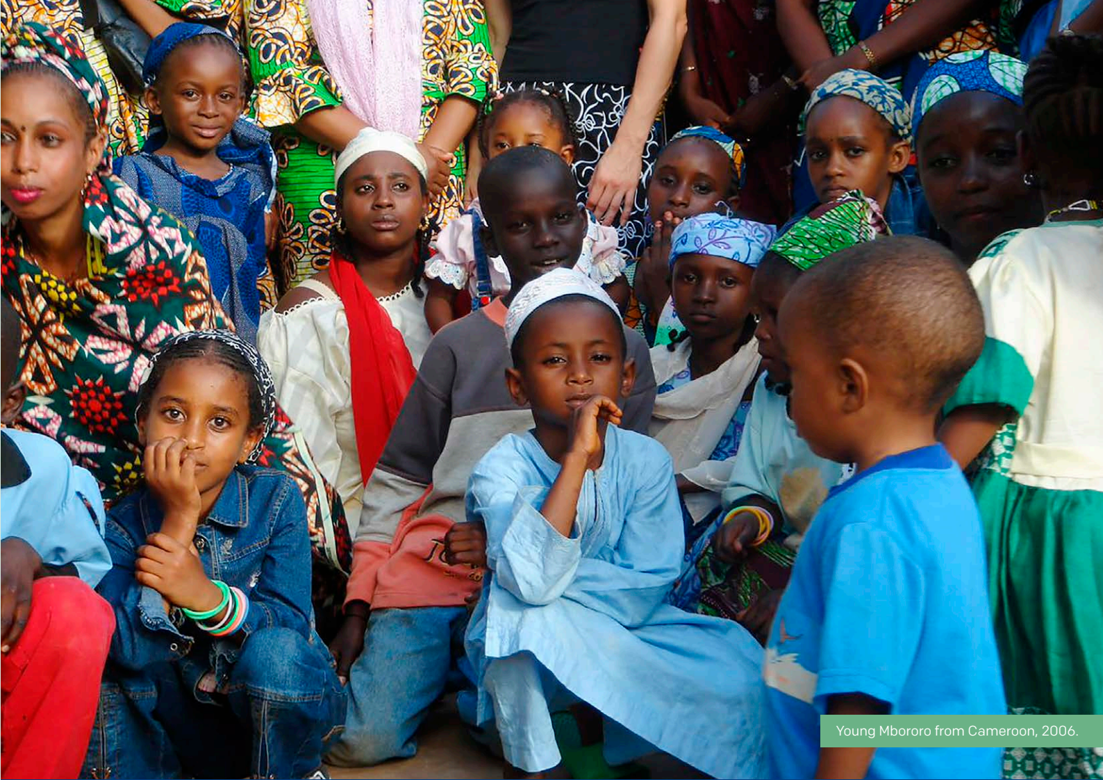
Young Mbororo from Cameroon, 2006.