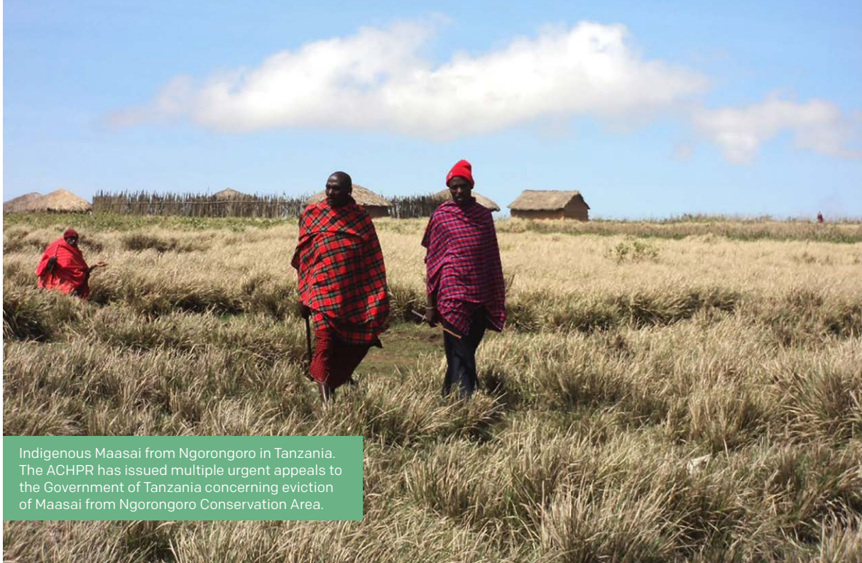
Indigenous Maasai from Ngorongoro in Tanzania. The ACHPR has issued multiple urgent appeals to the Government of Tanzania concerning eviction of Maasai from Ngorongoro Conservation Area.